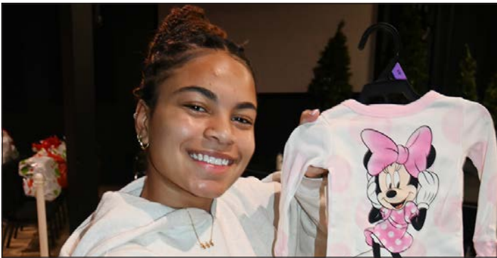
ONTARIO'S WARRIOR LEADERSHIP COUNCIL helped with Crossroad's Adopt-A-Child program, which serves over 1,000 local children.