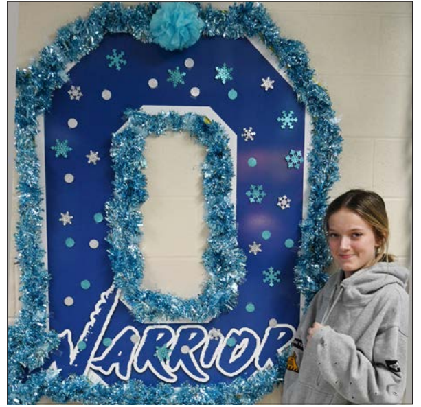
ONTARIO HIGH SCHOOL students worked together to decorate the hallways for Christmas. Each class had a theme: freshmen, Grinch; sophomores, Santa's Workshop; juniors, Blue Christmas; and seniors, Nightmare Before Christmas.