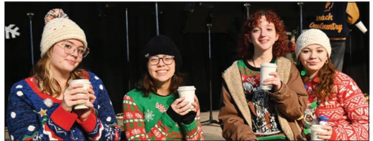
THE ONTARIO HIGH SCHOOL Jazz Band performed at the Lake-side Pavilion at the Columbus Zoo on Dec. 4.

Join the FREE Tribune-Courier Email List and Receive the Weekly Issue Fill Out the Form at http://eepurl.com/hnS9N9