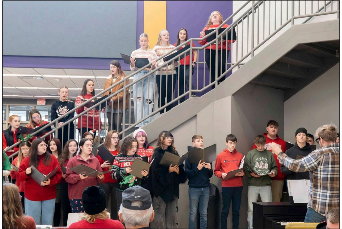
STUDENTS FROM LEXINGTON'S KEY CLUB pitched in at the annual Breakfast with Santa on Saturday, Dec. 7. The Lexington Kiwanis Club served sausage and pancakes to over 900 community members while Santa posed for photos, the PAC screened holiday classics, Una Voce sang carols and orchestra members performed in a festive strings ensemble.