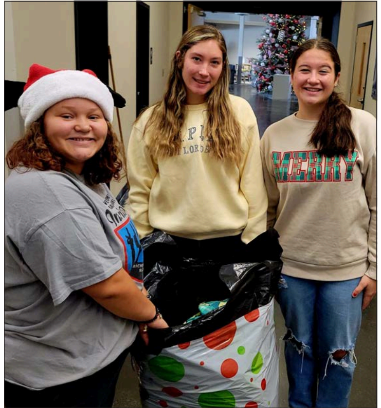
LEXINGTON HIGH SCHOOL LEADERSHIP COUNCIL students rolled up their sleeves to help organize and pack gifts for the Blessings and Bows Christmas Project at Crossroads Church in Mansfield. They worked to help spread holiday cheer to children in Richland County. They packed hundreds of presents.