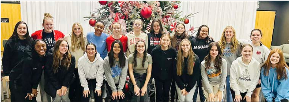
MANSFIELD CHRISTIAN SCHOOL students helped at Crossroads Church's Blessings and Bows distribution day. They assembled, packaged and wrapped gifts for local residents in need, The MCS high school girls basketball team helped deliver gifts and cookies to local families.