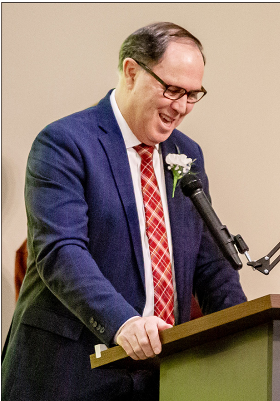
City of Shelby Mayor Steve Schag