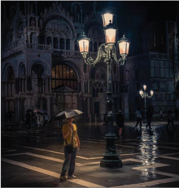
Piazza San Marco in Venice, Italy